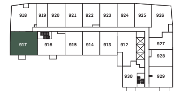
LEVEL 09 & 10