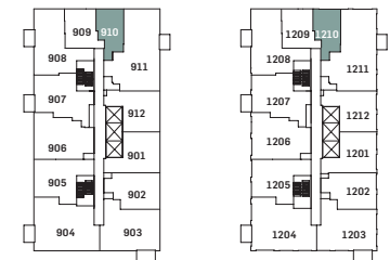
Level 09-11, 13-15, 17-24